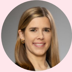
Elisabeth Margue, Minister of Justice